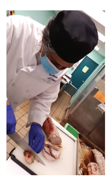
, Roast Pork – Peel garlic, insert garlic into pork loin. Season and roast. Slice when done.