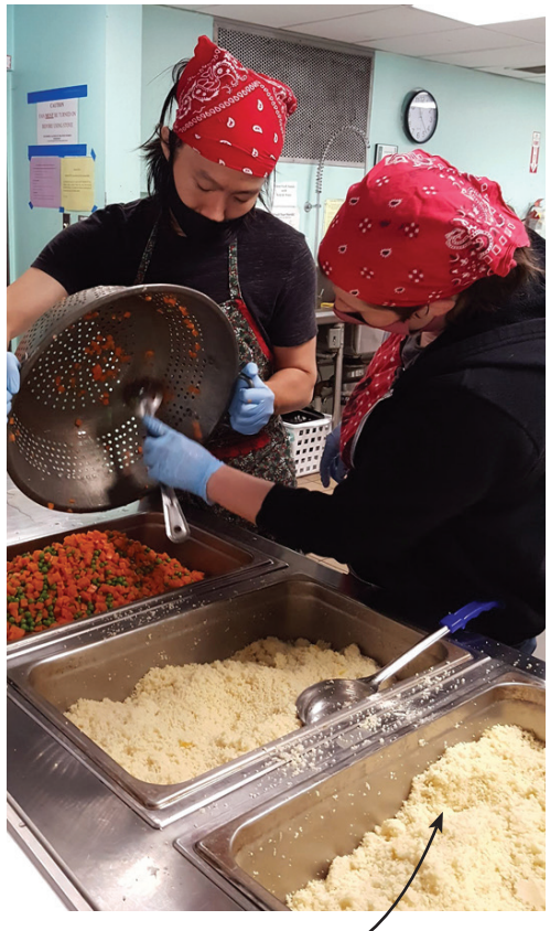
Peas and Carrots get added to couscous flavored w butter, _____ lemon, cumin and vegetable stock.