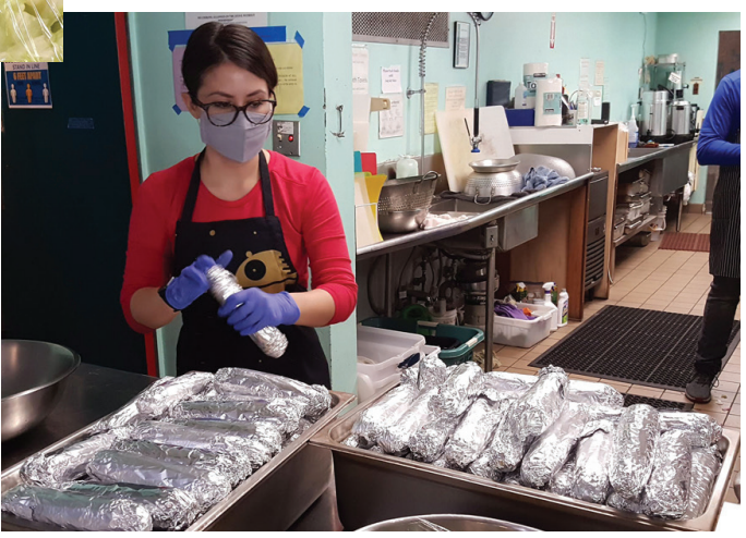
Foiling corn before baking