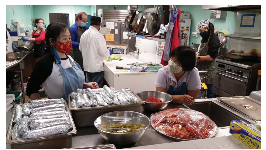
Socializing with distancing

We Did It!! #3 Loaves and Fishes Community Dinner, June 06, 2020 @ Newman Hall-Holy Spirit Parish, Berkeley, CA.