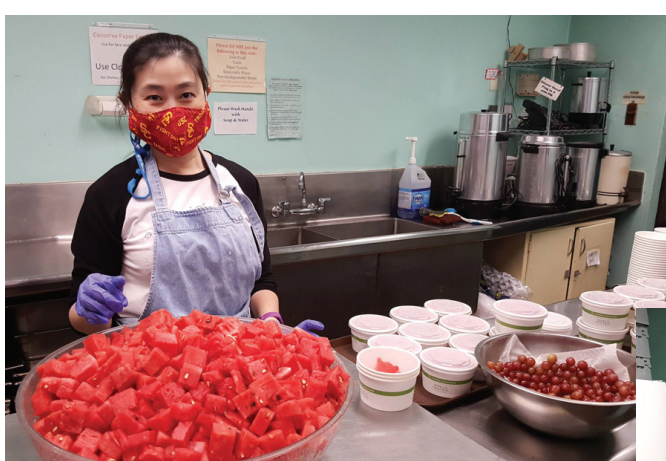
Making watermelon bowls