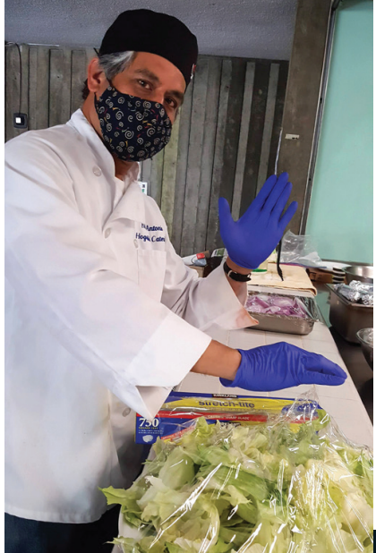
Lettuce make you laugh