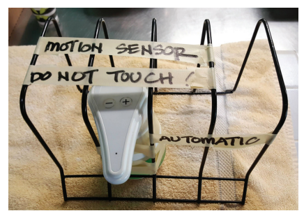
Motion sensor hand sanitizer dispenser