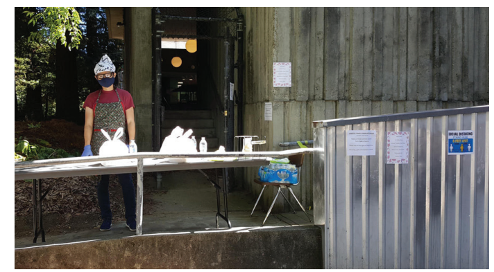
Meals & beverages ready for our guests at 2pm